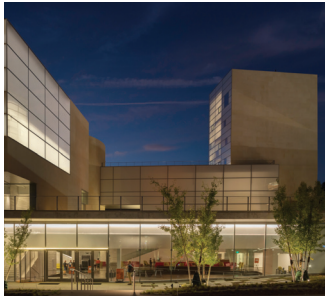
Lewis Arts complex Home of Programs in Dance, Theater, Music Theater and Princeton Atelier.