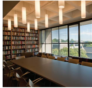
New South Home of the Program in Creative Writing