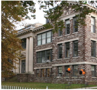
185 Nassau Street Home of the Program in Visual Arts